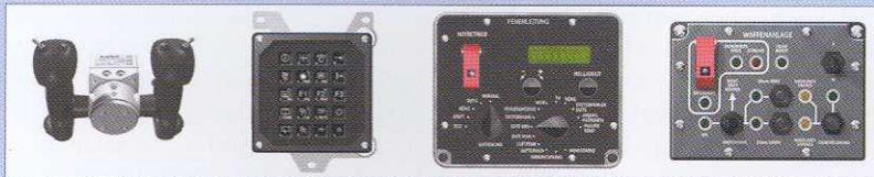
Left: The ITBs provide a very easy-to-use student interface based upon schematics of a vehicle's primary systems.